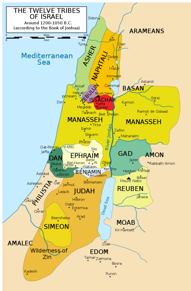
Map to help visualize descriptions of boundaries CLICK TO ENLARGE

But the troops whom Amaziah sent back from going with him to battle, raided the cities of Judah, from Samaria to Beth-horon, and struck down 3,000 of them and plundered much spoil - Beth horon is in the tribal distribution of Ephraim (see map above - locate Ephraim) and is about 12 miles NW of Jerusalem.