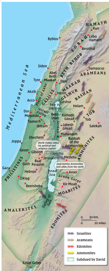
Valley of Salt at Southern End of Dead Sea NIV Study Bible

Now Amaziah strengthened himself and led his people forth, and went to the Valley of Salt and struck down 10,000 of the sons of Seir (Edomites).